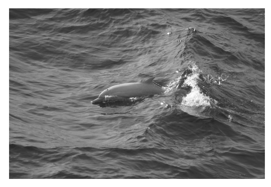
Figure 1. Anomalously white pantropical spotted dolphin ( Stenella attenuata graffmani ) photographed off the Pacific coast of Panama.

An all-white "coastal" pantropical spotted dolphin ( Stenella attenuata graffmani ) calf was sighted and photographed in a school of about 60 individuals (primarily mothers with calves, and juveniles) in shallow coastal waters off western Panama, near Isla de Coiba (07°18'N, 81°56'W), on 20 November 2003 from NOAA Ship McArthur II (Figure 1).