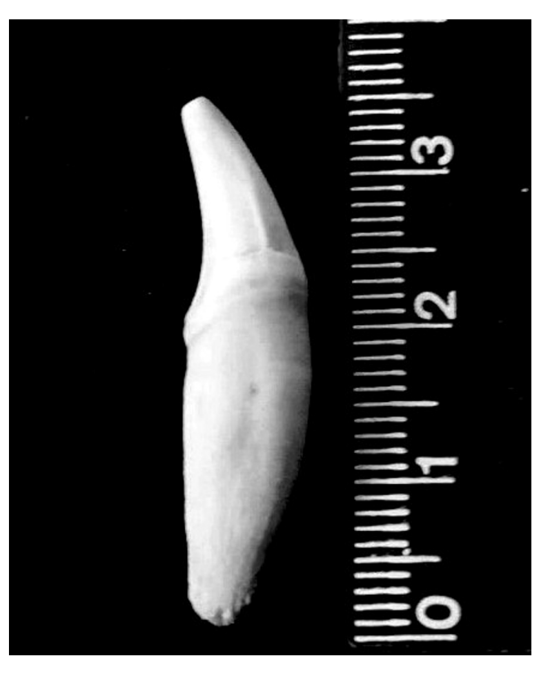
Figure 1. Upper canine tooth of giant otter ( Pteronura brasiliensis ). The scale is in centimeters.

The stained sections were placed into a 1:1 mixture of glycerin and distilled water for 5-10 minutes and then transferred to 100% glycerin for over 5 hours. The sections were then mounted between microscope slides and coverslips, and sealed with Entellan<sup>®</sup>.