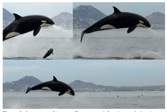
Figure 3. Sequence of images (from upper left to bottom) showing an orca, Orcinus orca , spewing water from its mouth, behavior seen when chasing a short-beaked common dolphin, Delphinus delphis .

The similarities between these events provide insights into the ecology and foraging behaviour of orcas off Baja California. In all cases, the group size was small, which in this species is usually an indication they specialise in feeding on aquatic mammals. For example, transient orcas off the North Pacific feed almost exclusively on aquatic mammals and travel in groups of 1 to 15 individuals, although the most common group size is 3 (Baird and Dill, 1995). On the other hand, resident orcas that feed almost exclusively on fish live and travel in larger groups (Bigg et al. , 1990). Similar group sizes were observed for orcas off Scotland and Iceland (Beck et al. , 2012). Orcas in the Gulf of California are seen in groups of between one and 30 individuals, with a mean of 5.5 (SD = \pm 0.8 ), and most groups consisting of fewer than seven animals (Guerrero-Ruiz et al. , 1998, 2006).