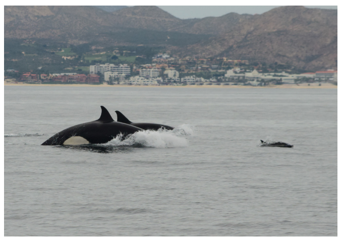
Figure 4. Two orcas, Orcinus orca , chasing a short-beaked common dolphin, Delphinus delphis , that became isolated from its group off Cabo San Lucas, Baja California, Mexico.

The cooperative aspect of these observations is consistent with what has been seen in other populations. For example, along the Antarctic Peninsula, ecotype B orcas hunt seals that are resting on floating ice, especially Weddell seals, Leptonychotes weddellii , by swimming close to each other at high speeds, generating waves as they pass under the ice. The wave washes the seal off into the water where the orcas, including juveniles and calves, work together to capture the seal, which is shared between group members (Pitman and Durban, 2012).