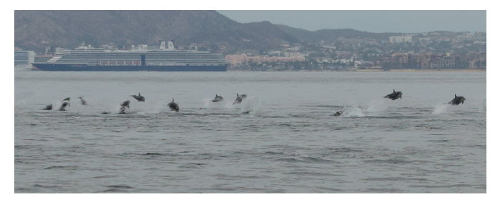
Figure 2. Group of short-beaked common dolphins, Delphinus delphis , showing a flight response to the presence of orcas, Orcinus orca , off Cabo San Lucas, Baja California, Mexico.

1. Caught On Video: Breaching Orca Slams Into Dolphin In Mid-Air – CBS Los Angeles (cbslocal.com)