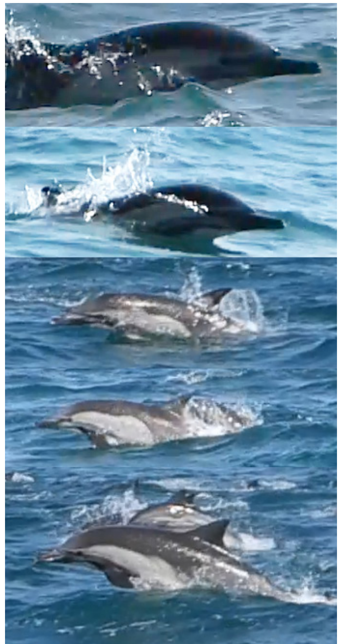
Figure 3. Frames extracted from the videos of long-beaked common dolphins ( Delphinus bairdii ) taken around Santa Clara Island, Ecuador, in November 2022.

The presence of the long-beaked common dolphin in Ecuadorian waters could be related to favorable oceanographic conditions at the time of the record (November 2022). The northernmost sighting occurred during the cold phase of the El Niño Southern Oscillation (ENSO) event, La Niña, when the sea surface temperature in the SE Pacific was 1°C cooler on average due to the increasing intensity of the SE Pacific anticyclone (ERFEN, 2022). The species' range would also be sensitive to temperature increases during