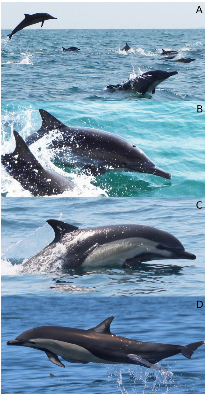
Figure 2. Long-beaked common dolphins ( Delphinus bairdii ) photographed off Santa Clara Island in November 2022 (A and B) and short-beaked common dolphins ( Delphinus delphis ) photographed in the northern part of the Gulf of Guayaquil in 2023 (C and D). Note the remora (family Echeneidae) attached to the lower flank of the short-beaked dolphin (D).

km) north of the long-beaked common dolphin's known distribution limit (Pacheco et al., 2019), its ecological and conservation relevance is underscored by the need for the involvement of an additional Range State in population conservation and management efforts.