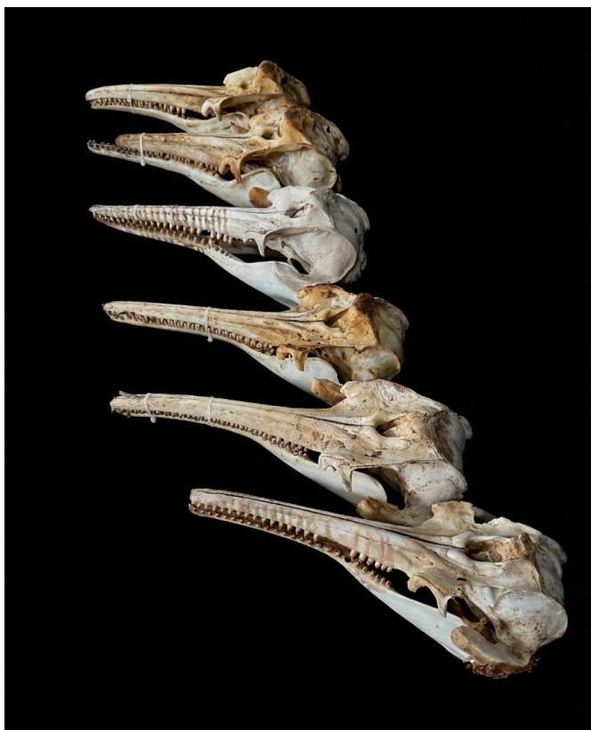
Figure 2. Collection comprising six Araguaian river dolphin ( Inia araguaiaensis ) skulls, collected from the Araguaia River with evident jaguar ( Panthera onca ) bite marks and currently housed at the Jaguar Conservation Fund.

Event 4: In early September 2025, a new record of a river dolphin predated by jaguars was publicized through a video circulating online. The event occurred near the municipality of Aruanã, Goiás, more than 500 km upstream from the first documented record in São Félix do Araguaia. Upon learning of the case, the team contacted a fishing guide collaborating with the 'Araguaia Vivo 2030' Program to retrieve the skull at the site. The carcass showed consumption restricted to the melon, head, and neck regions. Unlike previous cases, however, the animal was found on a high riverbank adjacent to a deeper stretch of the river. This observation suggests that jaguar ambushes on river dolphins are not necessarily associated with shallow-water areas, expanding the understanding of the ecological contexts in which such events may occur.