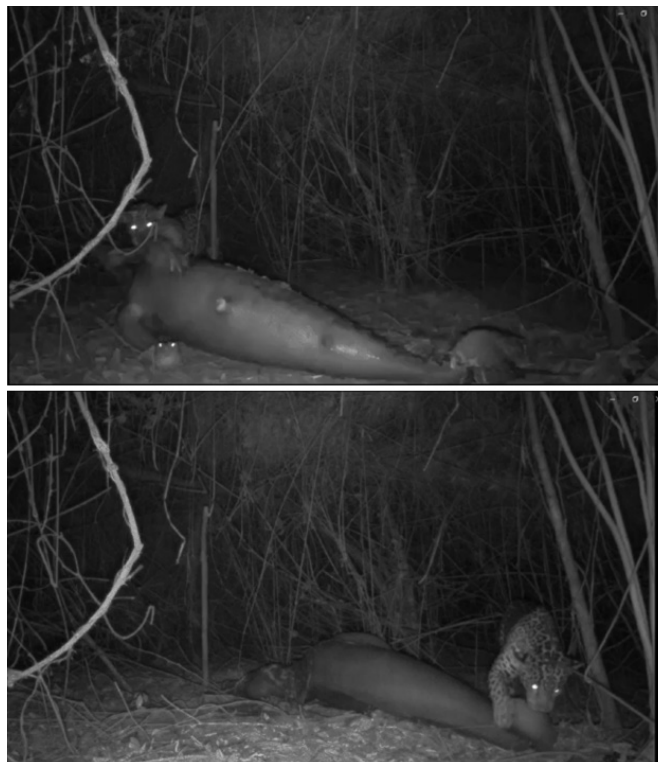
Figure 3. Records obtained from a camera trap installed to monitor the consumption of an Araguaia river dolphin preyed upon by a jaguar, recorded in March 2024 on the left bank of the Araguaia River, near the municipality of São Félix do Araguaia.

The jaguar's current distribution overlaps entirely with that of South American freshwater dolphins, yet despite extensive research on both taxa, no detailed material evidence of active hunting had previously been documented. Here we present physical evidence confirming jaguar attacks on river dolphins (Fig. 4a, 4b, and 4c). Based on these material findings, it is now necessary to reconstruct the possible circumstances under which